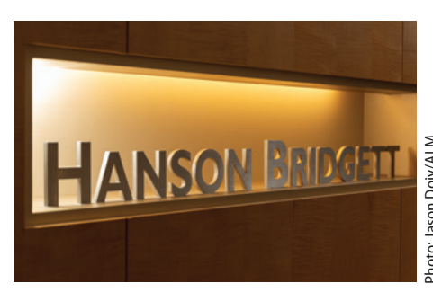
Hanson Bridgett offices in San Francisco.

Hanson Bridgett was accommodating with its collections from